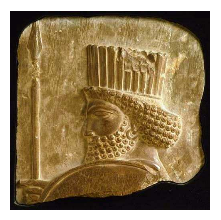
PERSIA, PERSEPOLIS Achaemenid dynasty (558-330 B.C.) Head of a Guard (Fragment of a low relief) 5th c. B.C. Sandstone 21 x 20.5 x 3 cm